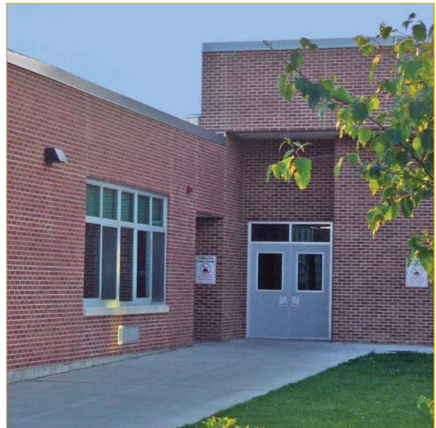
FRP Doors with recessed pull