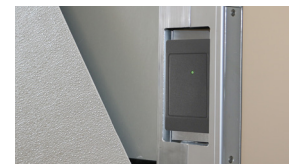
Proximity Card Reader