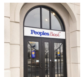
Curved Framing and Muntins