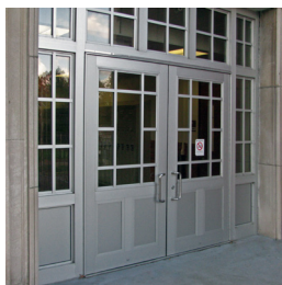
Custom Panels and Muntins