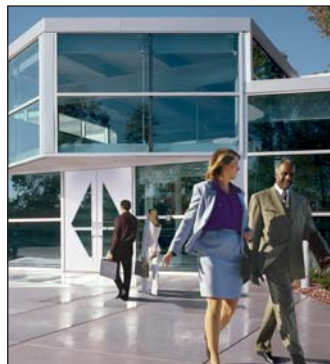
Aluminum Flush Doors