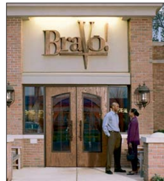
AMP Flush Doors