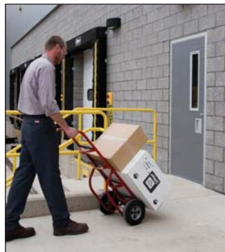
FRP Flush Doors